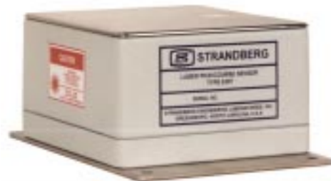
LASER PICK/COURSE SENSOR TYPE 6307

An economical solution for all your process control needs.